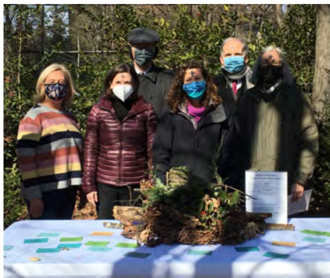
Ash Wednesday in the Memorial Garden, Feb. 17