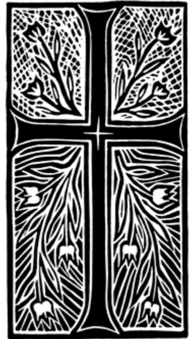
Cross of Life © 2012 Nicholas Markell | Eyekons

You are also invited to bring fresh flowers to the 9 AM and 11 AM services on Easter Day. Your flowers will be received at your vehicle and added to the Floral Cross just before the beginning of worship.