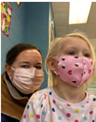
The staff and children are excited to be back in school.

We have many firsts for opening during a pandemic: Our first drive-through open house: Our first time taking temperatures and completing COVID questions at the outside doors of our classrooms. Having fun with friends is not a first for us.