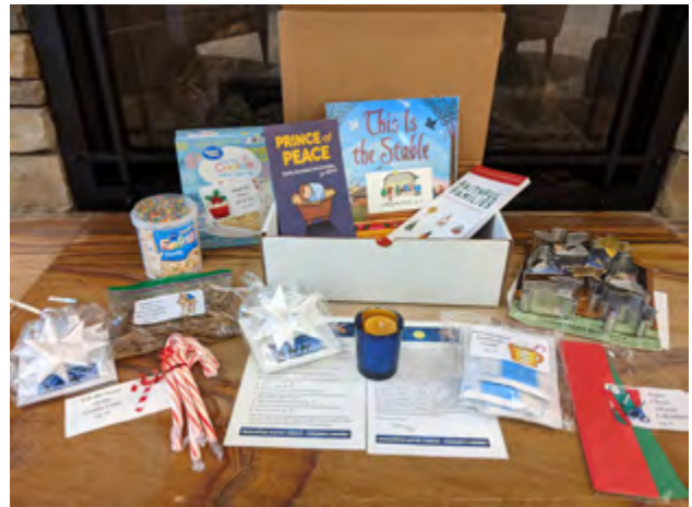
The Advent-in-a-Box is filled with resources and activities.