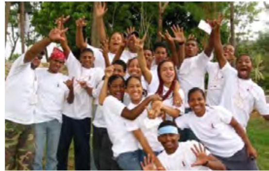
Teens in Pico Escondido in the Dominican Republic