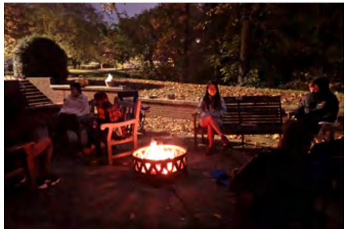
Social distanced gatherings in the Noffsinger Building courtyard.

We'll continue to pray for and with one another. At our latest small group gathering our groups embarked on a prayer walk around the Noffsinger building to help us reflect on the ways we can pray both as individuals and as a group. We'll continue to find ways of serving others in our community and our family of faith. Without our normal KBC.ym holiday traditions, we'll find new ways to celebrate the season together like none before.