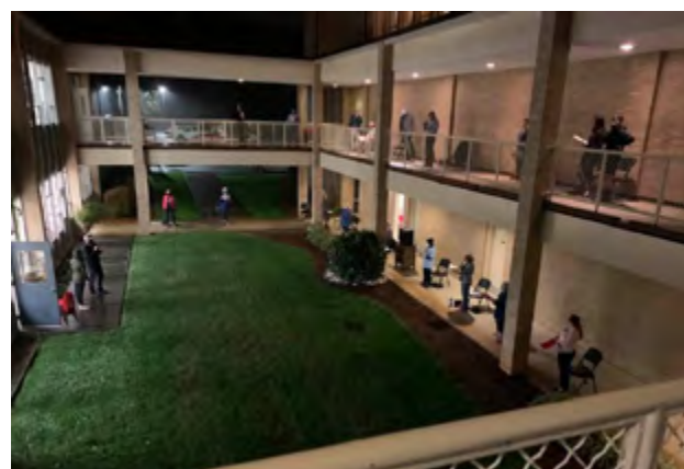
Making the music happen, even in the rain.