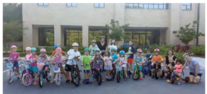
Many children gathered on a summer afternoon and took over the KBC parking lot with bikes and scooters