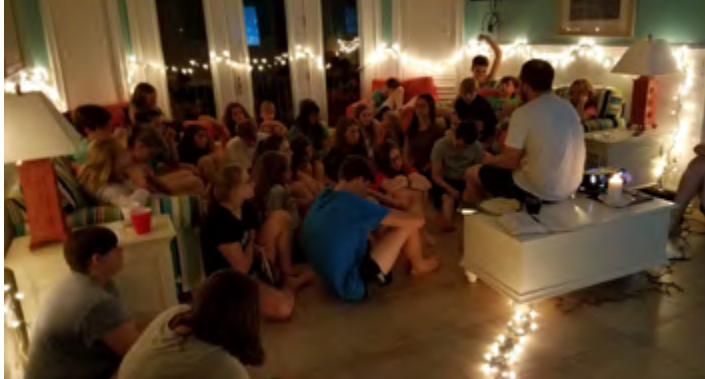
Youth Ministry Retreat 2018